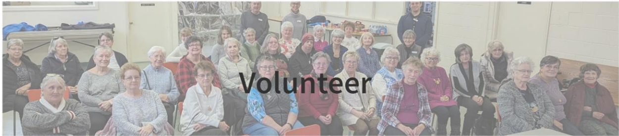
Opportunity Shop Volunteers at a Health and Safety Training Session